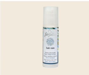
HAIR CARE DEEP RECOVERY HAIR MASK

Natural additional hair care without synthetics, PEG or silicones. Protects and maintains, using vegetable extracts and waxes for beautiful, shiny hair. Certified natural cosmetics (BDIH).