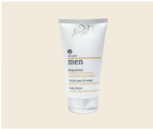
MEN BODY LOTION

Gentle cleansing for skin and hair 150 ml