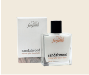
MEN SANDALWOOD, NATURAL AFTER SHAVE BALM