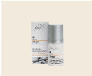
MEN FIRMING & MOISTURIZING FLUID