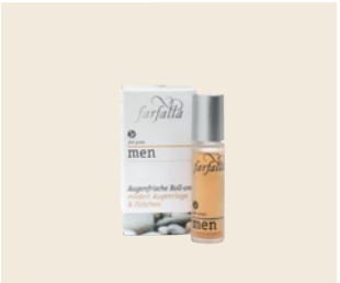
MEN ROLL-ON EYE REFRESHER

24hrs protection, without aluminium 50 ml