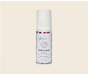
HAIR STYLING HAIR SPRAY