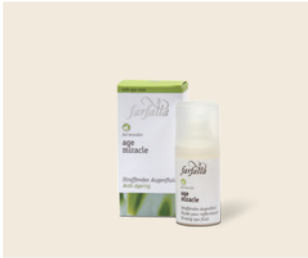
AGE MIRACLE FIRMING EYE FLUID