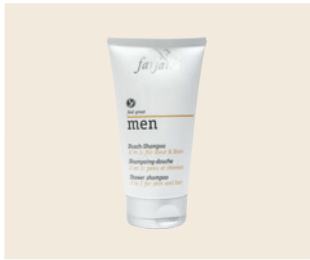
MEN SHOWER SHAMPOO

Gentle cleansing for skin and hair 150 ml