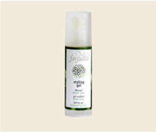
HAIR STYLING STYLING GEL