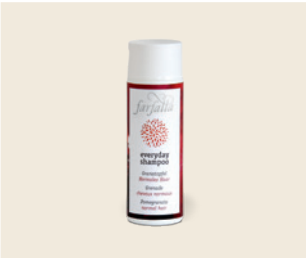
EVERYDAY SHAMPOO POMEGRANATE

For frequent hair washing 200 ml & 1000 ml