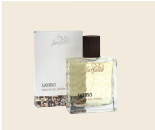
UOMO NATURAL EAU FRAÎCHE