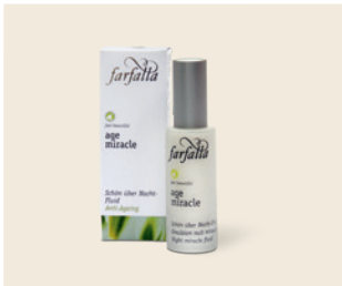
AGE MIRACLE, NIGHT MIRACLE FLUID

Lets the skin breathe deeply at night 30 ml