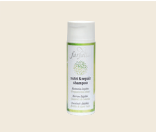
NUTRI & REPAIR SHAMPOO CHESTNUT-JOJOBA

For frequent hair washing 200 ml & 1000 ml