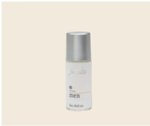
MEN ROLL-ON DEODORANT

24hrs protection, without aluminium 50 ml