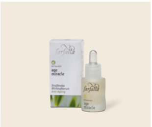
AGE MIRACLE, LIFTING SERUM