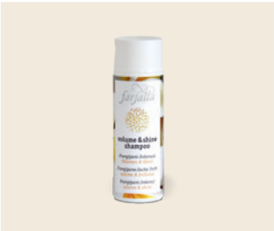
VOLUME & SHINE SHAMPOO FRANGIPANI-SACHA INCHI

For children and sensitive scalp 200 ml & 1000 ml