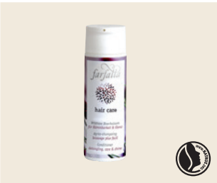
HAIR CARE WILD ROSE CONDITIONER