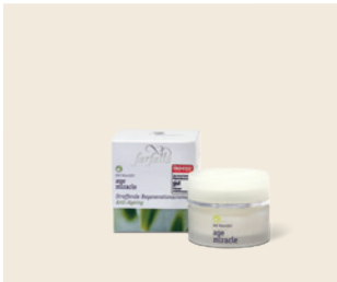
AGE MIRACLE, LIFTING & REGENERATING CREAM