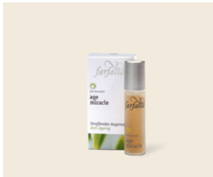
AGE MIRACLE, LIFTING EYE SERUM, ROLL-ON