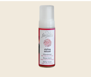
HAIR STYLING STYLING MOUSSE

Structure protection for healthy hair 150 ml