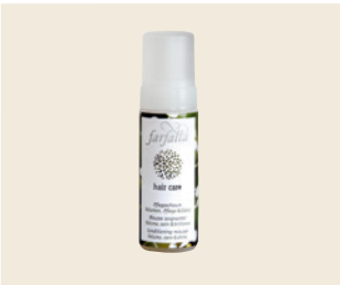
HAIR CARE CONDITIONING MOUSSE