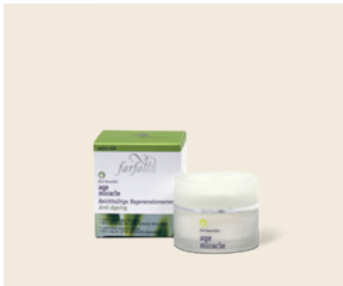
AGE MIRACLE RICH REGENERATION CREAM